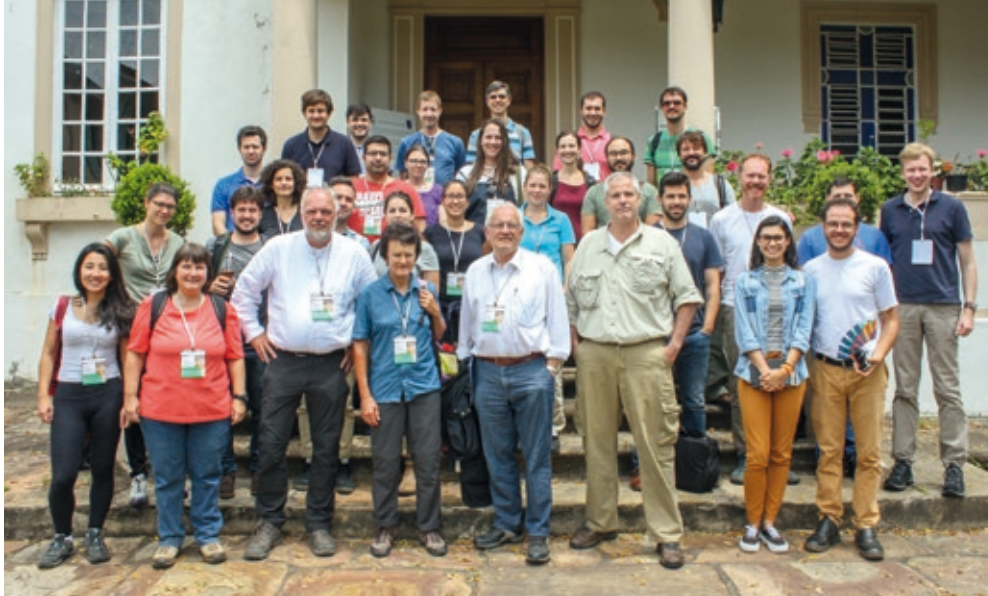
Image 7: The authoring group of young scientists, senior experts and academy representatives at the Workshop “Sustainable Water Management in Mining and Post-Mining Landscapes” from 1–5 October 2018 in Belo Horizonte, Brazil.