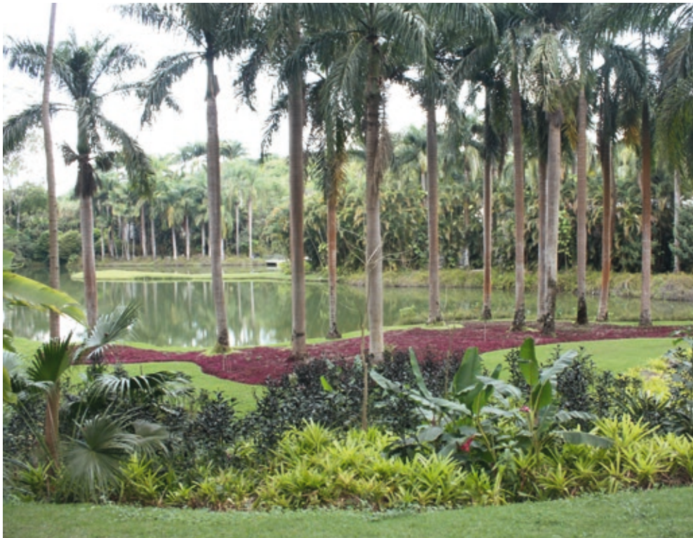
Image 6: The Inhotim Institute in Minas Gerais, Brazil was designed in an area that previously was degraded by mining and farming activities.

Over the course of human history, mining has had a profound—and unfortunately at times negative—influence on the environment, culture and societal development. However, we envision a future in which sustainable development is a central aspect of mining activities and in which socio-economic and environmental concerns are considered on a global scale. This includes a process dedicated to transformation that is more efficient, science-based and responsible, transparent and less environmentally and socially harmful. Key to this is a democratic, accountable and transparent approach built on trusting collaboration between all actors involved (governmental bodies, mining companies, the local population, researchers, nature protection agencies, and the public). The desired outcomes of such a successful transformation process are restored and sustainable post-mining landscapes. These will be socio-ecological systems—resilient to shocks/disturbances and with a self-confident identity—that have been repurposed, for instance, for recreation or renewable energy production and that are able to self-sustain their ecosystem functions and services. Hence, sustainability-oriented mining must acknowledge the environmental, economic and social dimensions of mining from the beginning and must aim at minimizing environmental impacts while assuring lasting socio-economic prosperity for all parties involved.