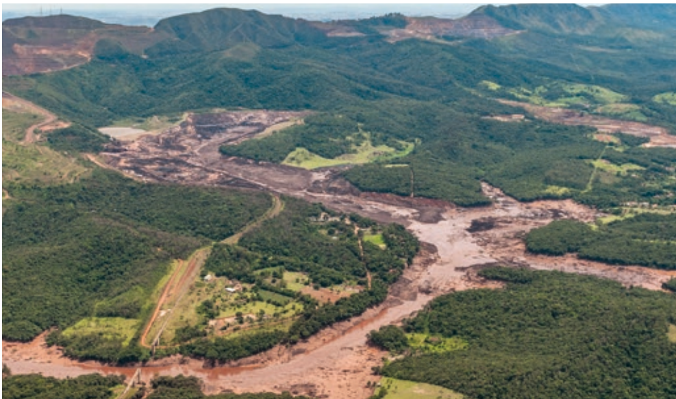
Image 2: Aerial photograph of the flooded areas after the Brumadinho tailings dam rupture in January 2019.

Recent mining catastrophies such as the tailings dam failures at Rio Doce, Brazil (2015), Brumadinho, Brazil (2019) and in Mount Polley, Canada (2014) (Petticrew et al., 2015) as well as in Nachterstedt, Germany, in 2009, where parts of an inhabited settlement slipped into a flooded open-cast mining area, have had tragic consequences including loss of human life and detrimental effects to entire landscapes and ecosystems (Wilson et al., 2016). These events demonstrate a critical need for effective failure mitigation, including preventive measures and contingency plans for immediate response actions. The proactive development of contingency plans is essential for decreasing risks inherent to regular mining operations as well as in the case of major failures (Sánchez et al., 2018). Therefore, any recommendation made in the public-industry-science discussions must be considered by the company and noncompliance must be documented.