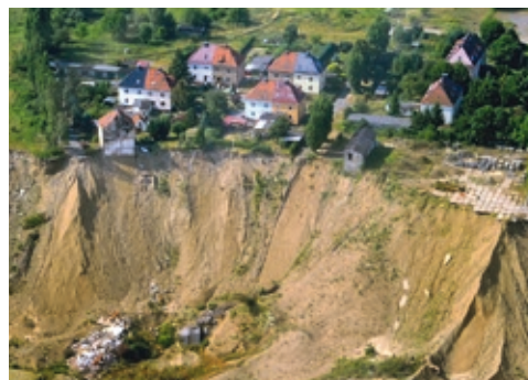
Image 4: In the Nachterstedt accident in Germany in 2009 three people died because parts of an inhabited settlement slipped into a flooded open-cast mining area.