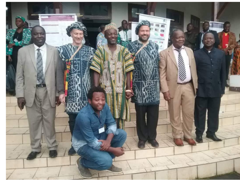
© 2018 Central African School for Electronic Structure Methods and Applications

meeting with policy makers, cultural leaders and politicians to discuss the necessity of funding research locally