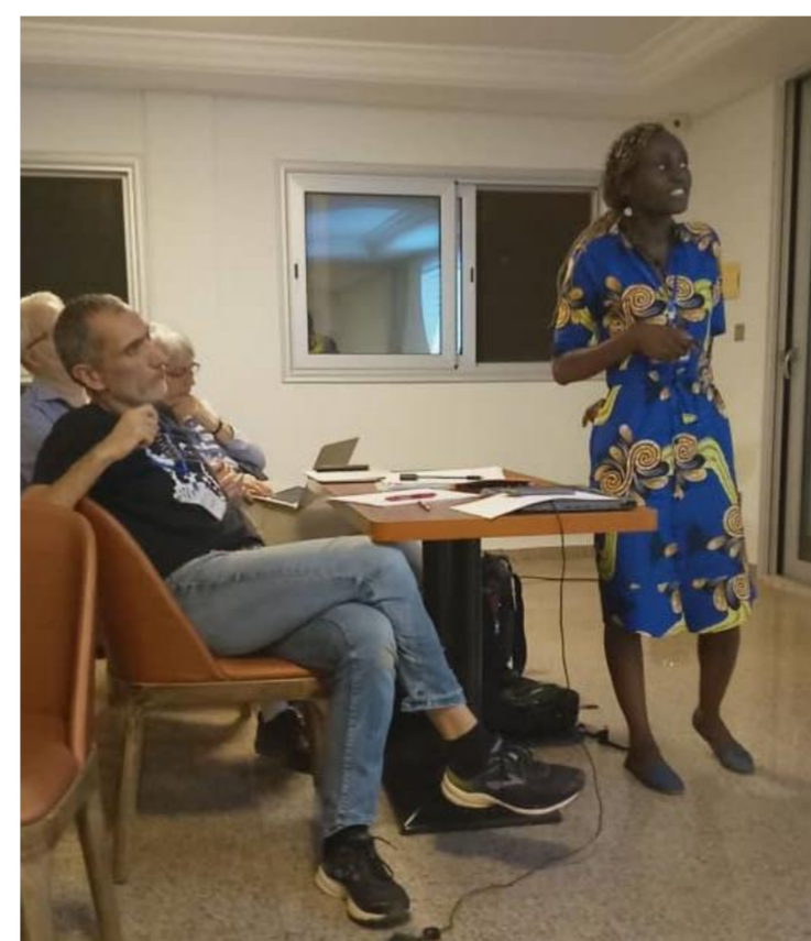
© 2019 Central African School for Electronic Structure Methods and Applications

promotion of young talents by negotiating research facilities or visiting positions in top research groups