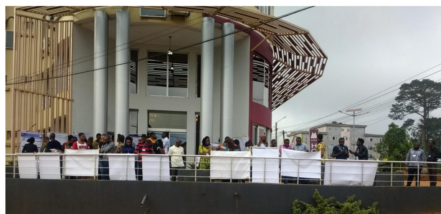
© 2019 Central African School for Electronic Structure Methods and Applications

schools, workshops, training on the state- to-the art techniques